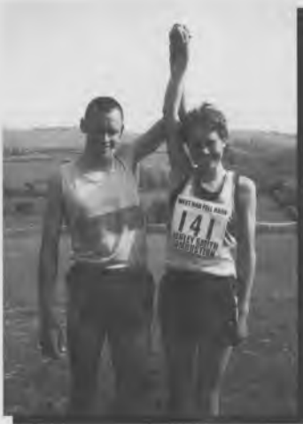
Brother and sister act u/20 and senior winners, West Nab