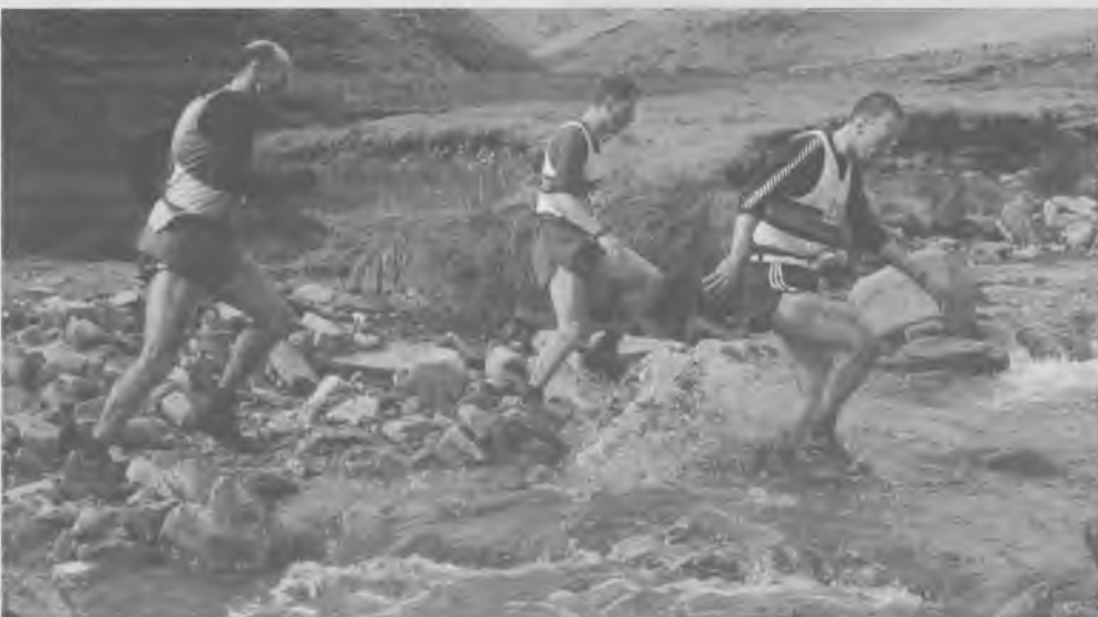
Crossing Ogden Clough on the Half Tour