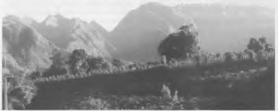
The mountains of Reunion Island

In late October each year, almost 2000 people gather before dawn in a sports stadium at the south of the island. Surely