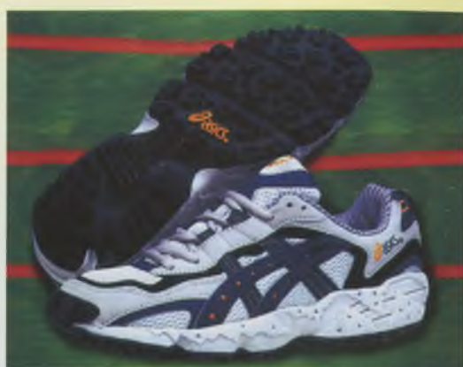
Asics Gel Trespass, Trail Shoe

Sizes 6, 7, 7½, 8, 8½, 9, 9½, 10, 10½, 11, 12