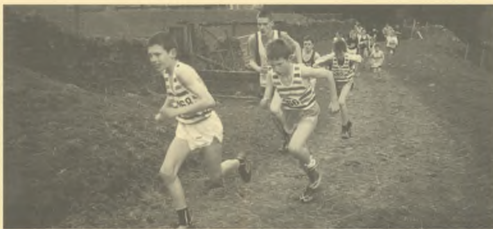
The Pendle junior race charges out of Barley