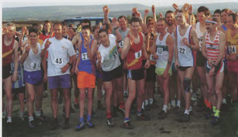
Starters egg each other on with real eggs.