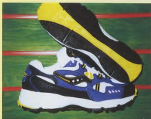
Saucony Kyote Trail Shoe