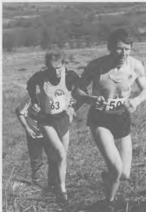
Climbing at Titterstone Clee