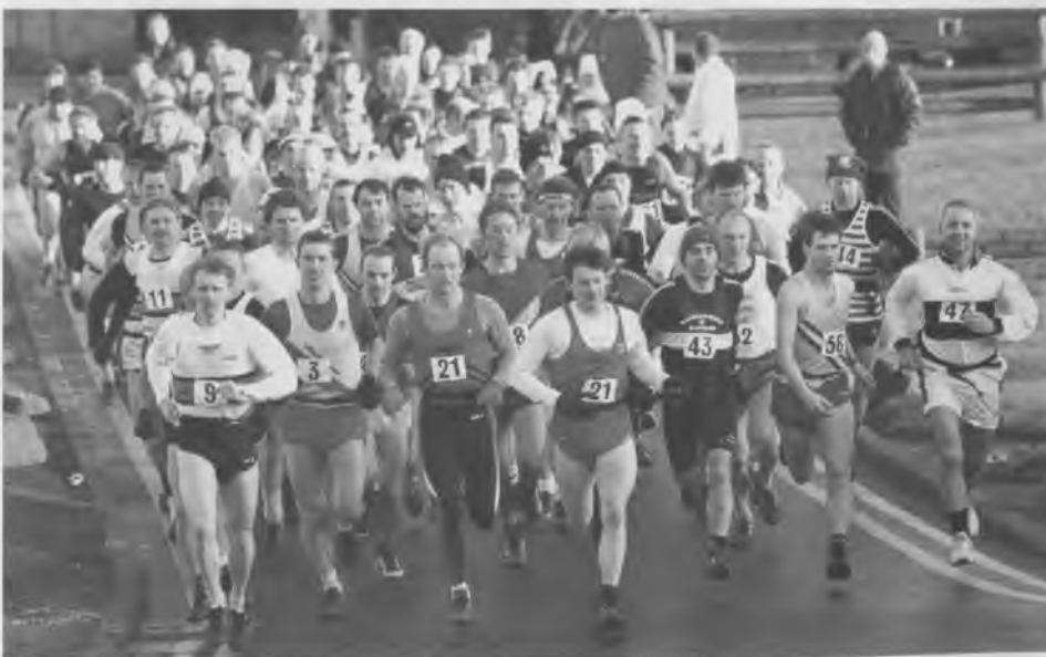
Rossendale Way Relay. The start from Marl Pits, Rawlins Hall.