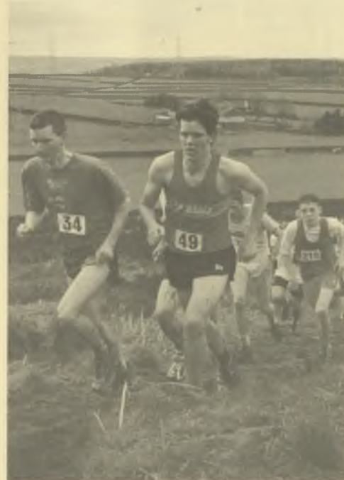
Young bunnies go for it