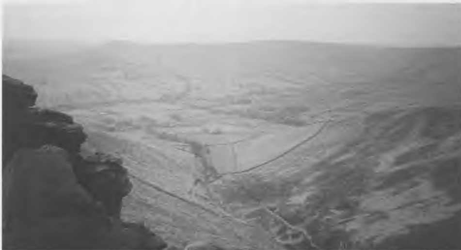
The rolling hills of the Edale Valley.