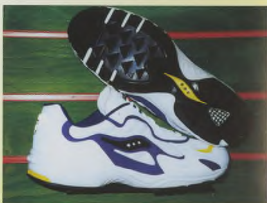
Grid Jazz i2

Well cushioned shoe, affording excellent grip on forefoot.