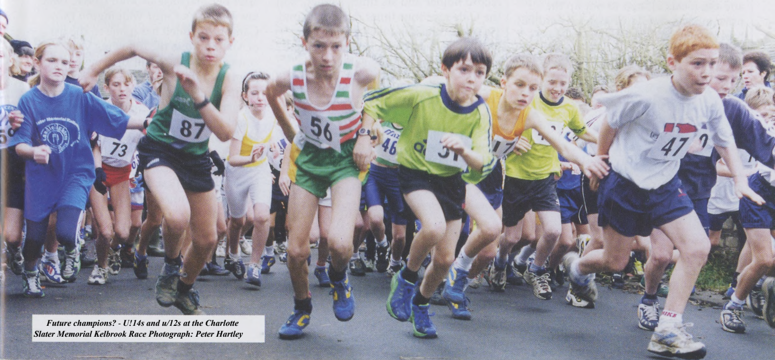
Future champions? - U14s and u12s at the Charlotte Slater Memorial Kelbrook Race