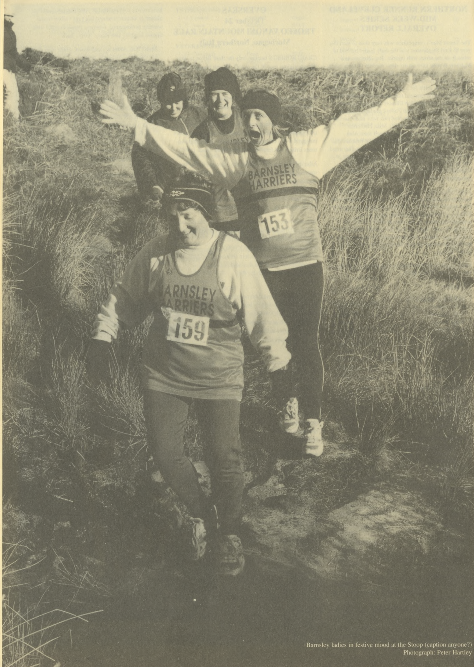
Barnsley ladies in festive mood at the Stoop (caption anyone?)