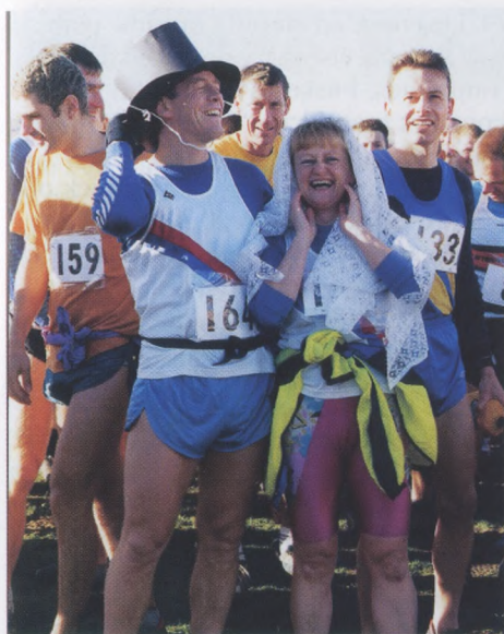
The happy couple