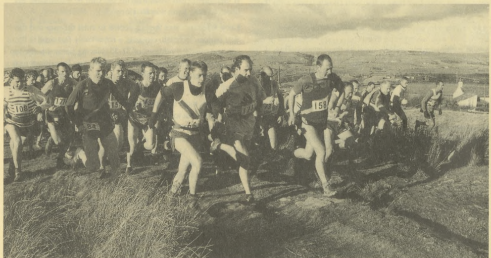
Start of Shepherds Skyline