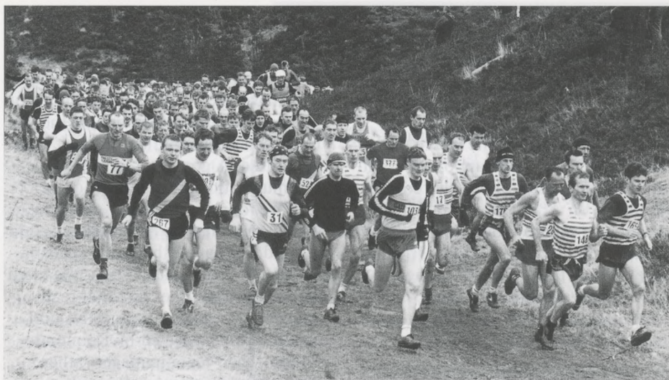
537 runners seeing out the old year.