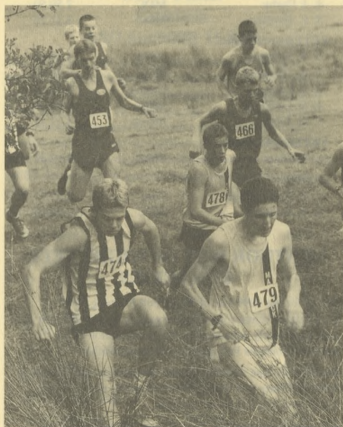
Thieveley Pike junior starters