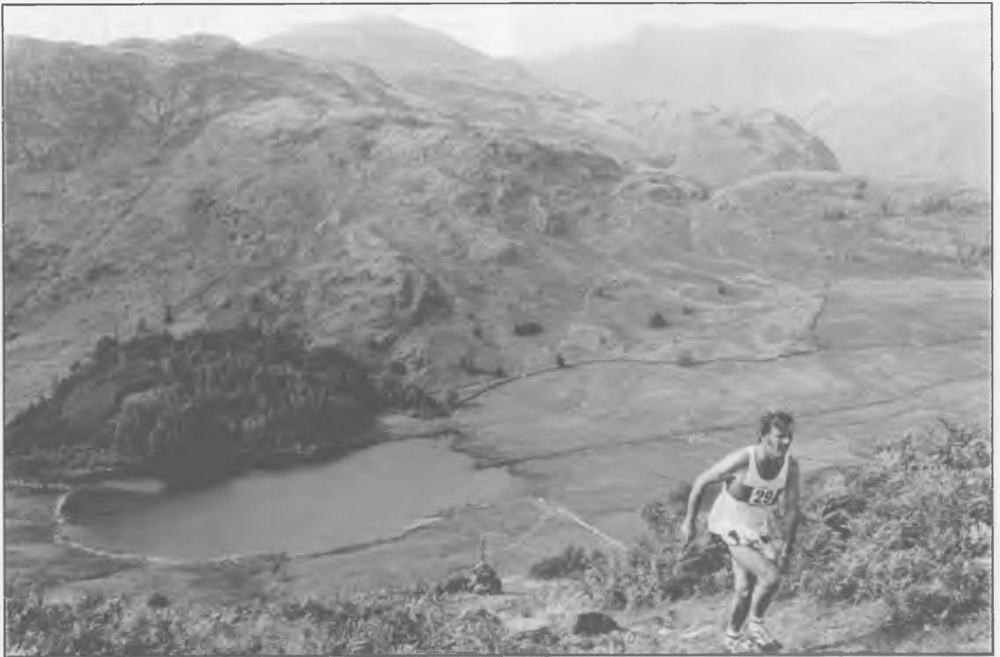
Above Blea Tarn in the 3 Shires