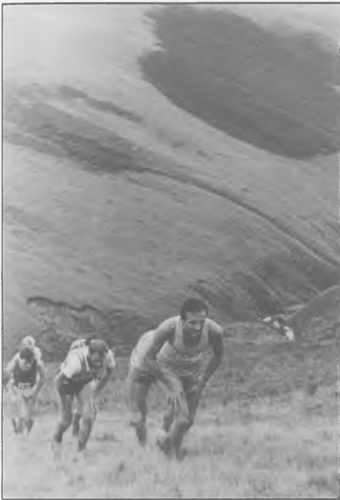
The climb to Mearley in the Pendleton