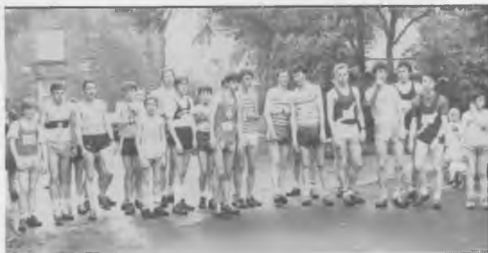
The start of the Saddleworth Junior Championship Race